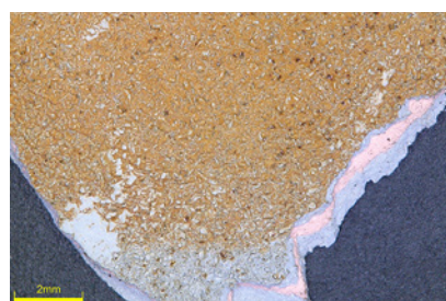
Underside of paint flake