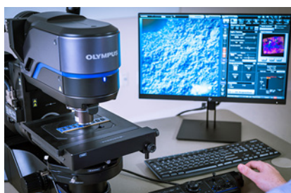
Examination of paint flakes by optical microscopy