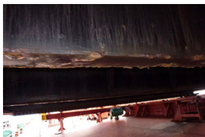
Cargo hold hatch covers