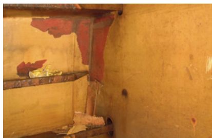
Water ballast tanks